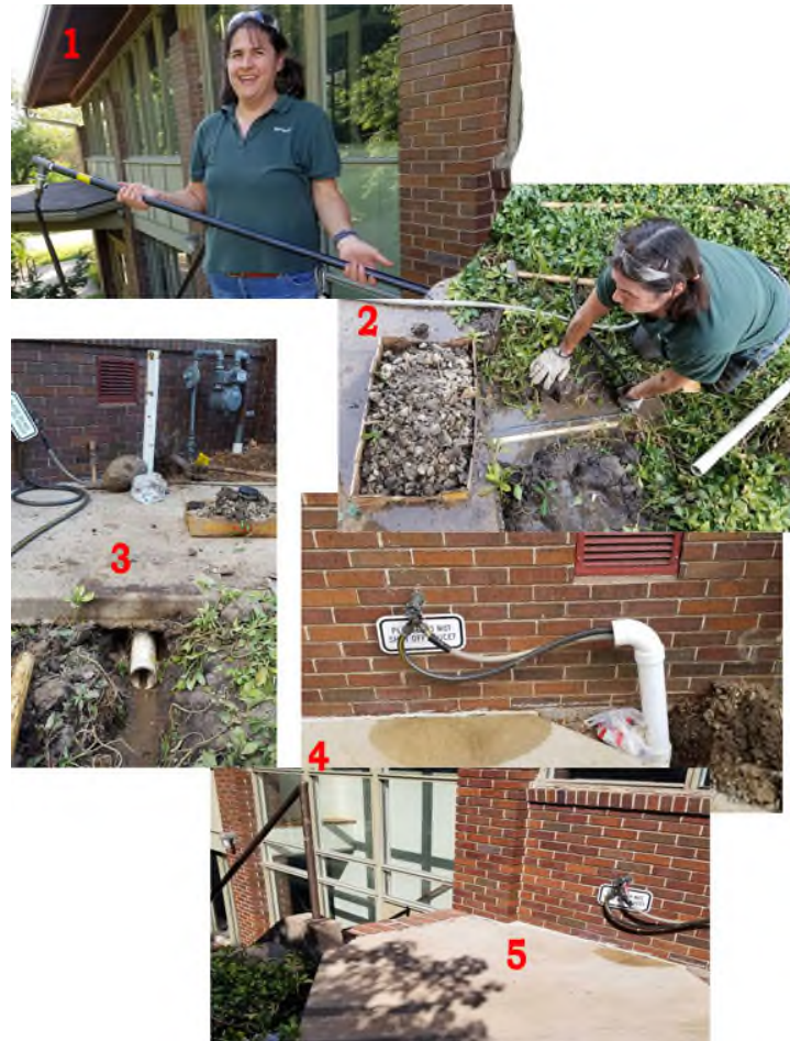
Recent work done to the UU Grounds