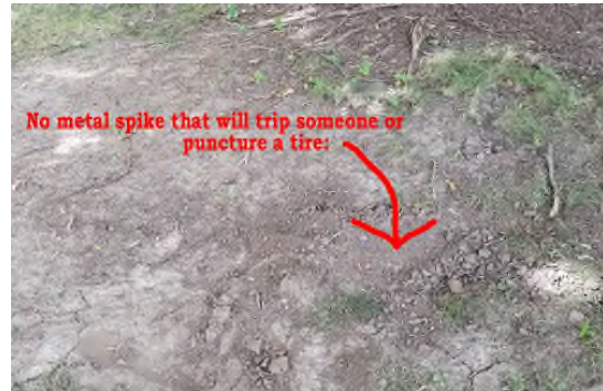
Metal spikes gone