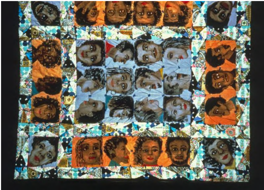
Faith Ringold Echoes of Harlem , 1980, Acrylic on canvas, dyed, painted and pieced fabric