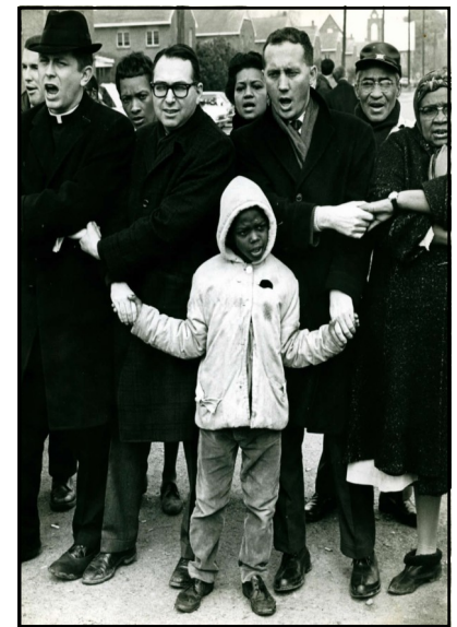
From the UUA archives.

I invite you to come and stretch your vision of what may be possible for you and our world with American philosopher Ken Wilber's Integral Vision and Approach. It holds the amazing potential to not only help you personally evolve but to also help solve the most serious and complex problems facing humanity today.